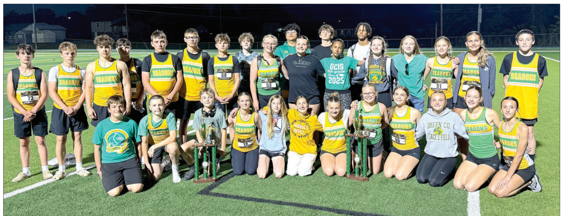
Green County Middle School Girls' team won the Bill Moore Invitational title Saturday evening with 101 points. Campbellville Middle placed second with 93. Green County Boys' team placed runner-up with 105 points. Campbellville Boys won the meet with 130.