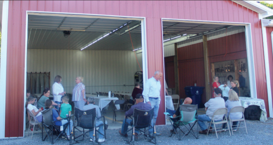
The recently completed 30 ft. x 42 ft. addition to the Grab Fire Station will provide much needed space for the department.

A link to join the meeting will be posted on the LCADD website at www.lcadd.org .