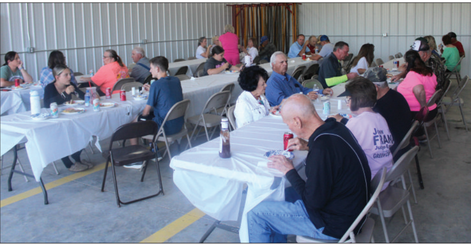
People attending this past Saturday evening's event at the Grab Volunteer Fire Station enjoyed a bountiful potluck meal.