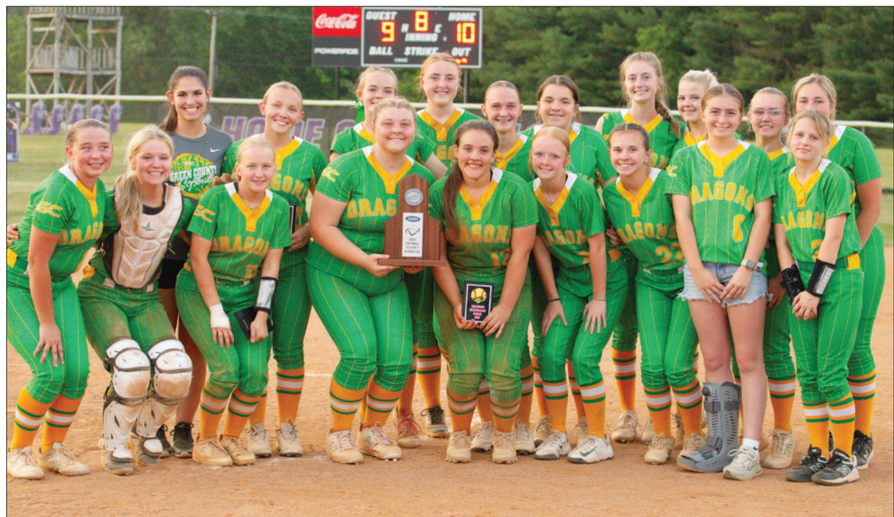
The Green County High School Lady Dragons were named KHSAA District Runner-Up Tuesday night after a hard-fought championship game against the LaRue County High School Lady Hawks. The Lady Dragons battled until the end, falling by one run in the bottom of the eighth inning with two outs on the board.

The championship game against LaRue County was everything a district championship should be, including the game going into an extra inning.