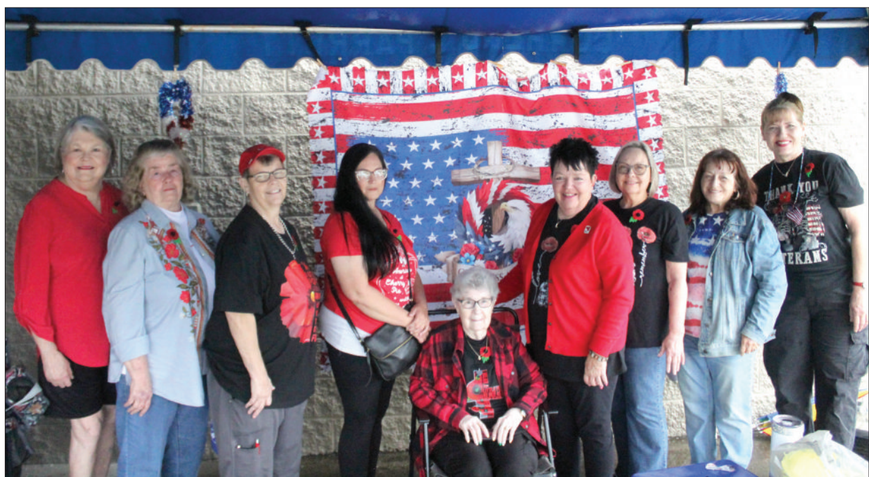
American Legion Auxiliary Unit 124 members distributed artificial poppies to the general public last Saturday at the Dollar General Market.