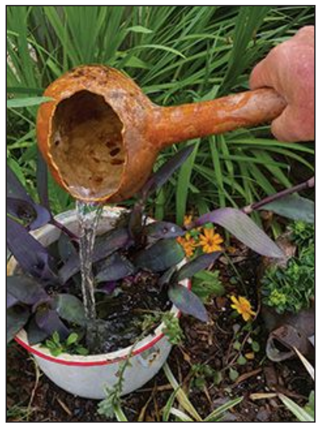
OLD SCHOOL IRRIGATION

They are best used two or three times a week to keep soil moist rather than letting plants go dry between soakings. I sometimes sink plastic drink bottles with tiny holes in the bottom beside big plants and fill as needed. If you value yours as more than just a flat "mow what grows" space, understand that our common Asian turfgrasses require a deep soaking at least every three or four weeks lest they