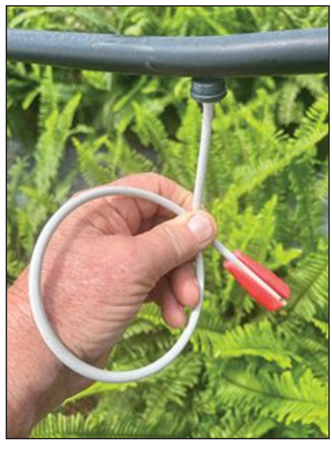
DRIP IRRIGATION IS EASY

Lastly, I must also emphasize that our most important garden wildlife, including songbirds, butterflies, bees, frogs, and lizards depend on clean water. No good gardener should be without a small pond (even above