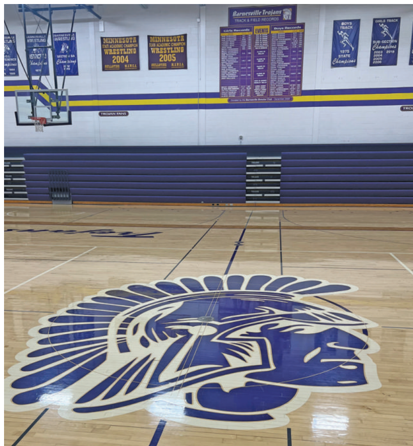
The middle school gym features a Trojan head in gold and yellow tones, another example of how colors have varied across the district over time.