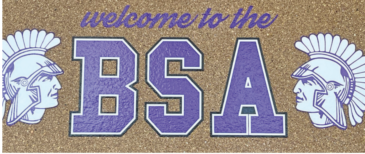
A sign at the Barnesville Sports Arena (BSA) features one version of the Trojan head, reflecting the variety of logos currently used across the district.

That question is guiding two parallel efforts unfolding side by side. One focuses on how the district