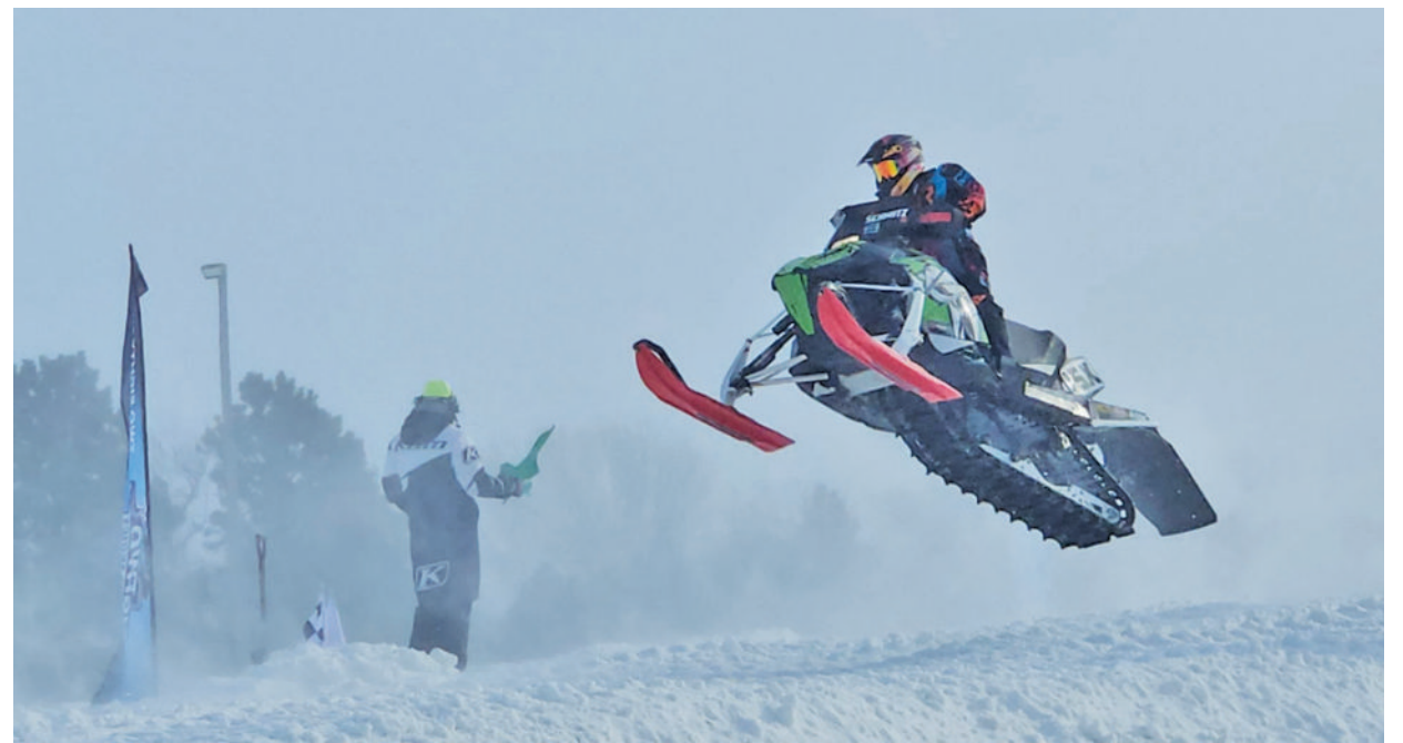
Liv launches into the air during a snocross race, a moment that captures the confidence and determination she has built in the sport.