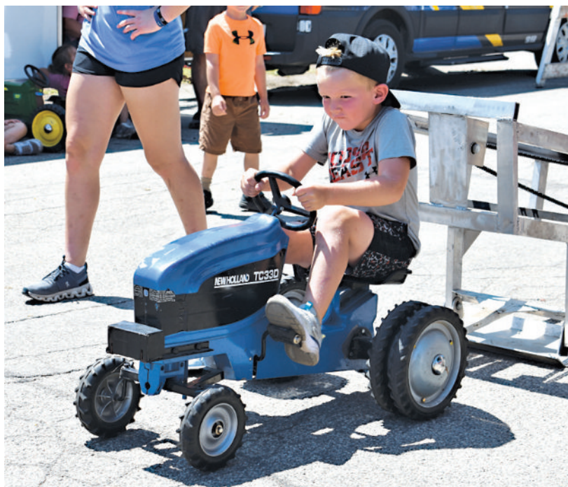
A new event, a pedal pull contest, will make its debut at Potato Days this summer.

With a mix of nostalgia, new experiences, and strong community spirit, Potato Days 2026 (Friday and Saturday, August 21-22) is shaping up to be a can't-miss celebration in Barnesville.