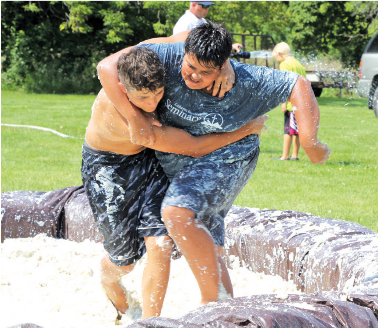
Mashed potato wrestling, definitely a fan favorite, will be returning to the Potato Days Festival in 2026.