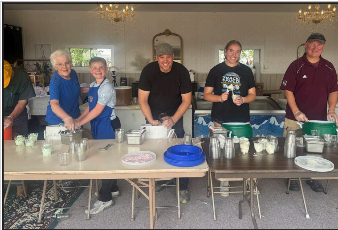
Make sure to get some ice cream after breakfast.