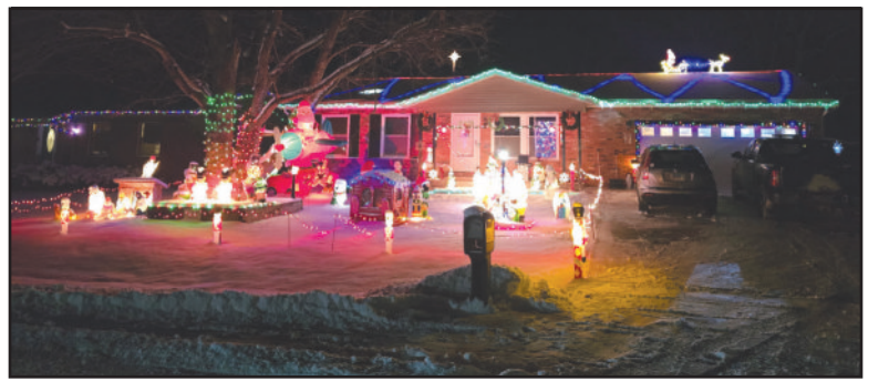
Best Themed Display: Rich & Christy Koch

Located at the marina, Fro-Smokes impressed with painted holiday windows, decorated trees, (Continued On Page 2)