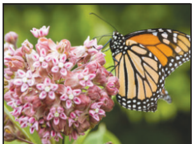
An orange and black monarch butterfly landing on milkweed plant bloom

Embark on a culinary adventure with the exciting lineup of new vegetables unveiled for the 2026 season. Learn about the unique characteristics, growing tips, and delectable uses of these (Continued On Page 5)