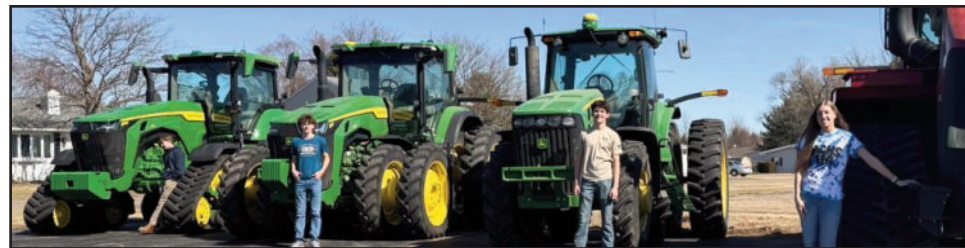
MIDWEST CENTRAL CELEBRATED FFA WEEK in style with Bring Your Tractor to School Day during FFA week.