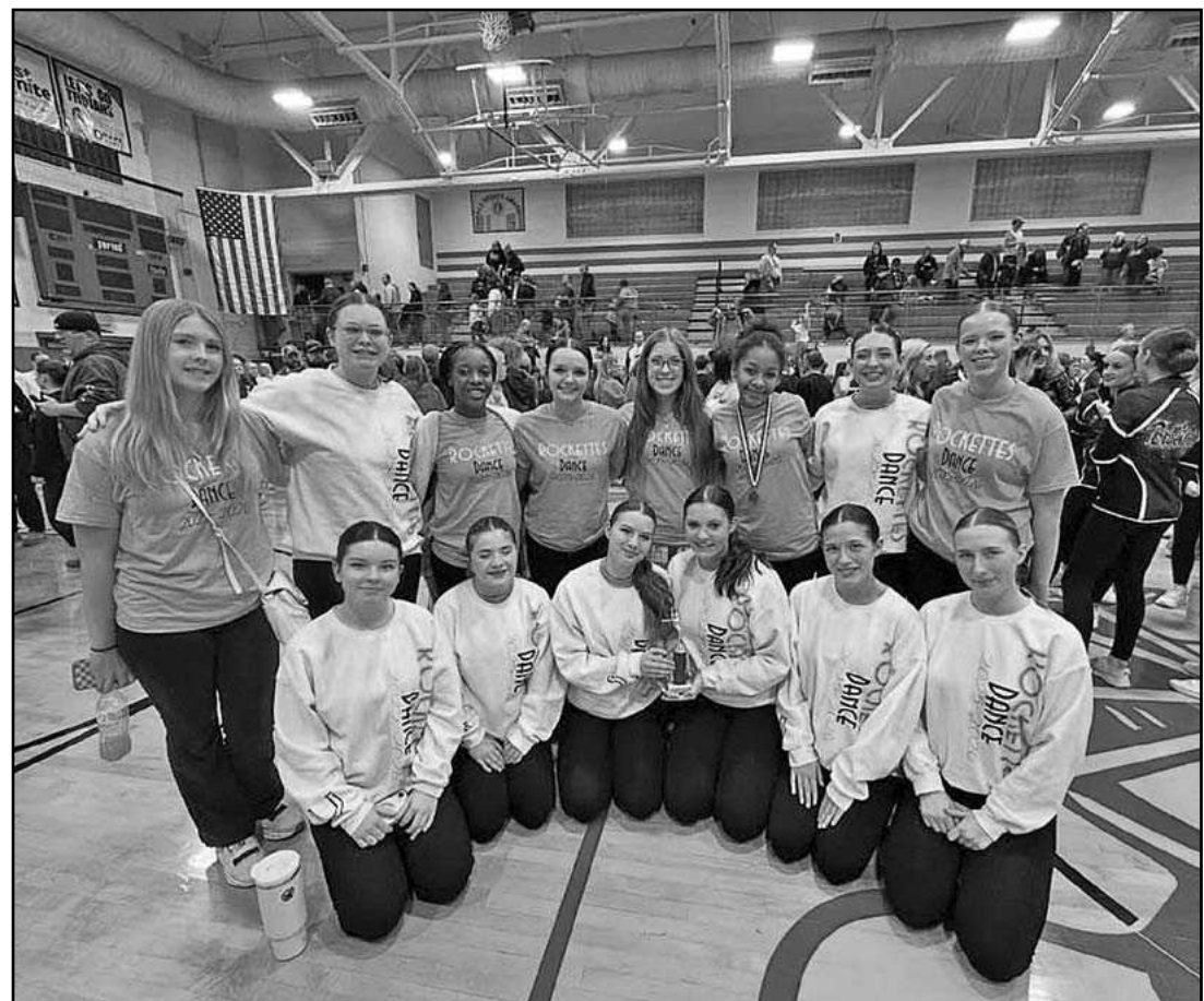
Rockettes place 1st in HipHop and 4th in IHSA at the Charleston Competition.

Dance competed in Charleston on Saturday. They placed first in Hip Hop and 4th in IHSA. They will compete again next Saturday in Clinton.