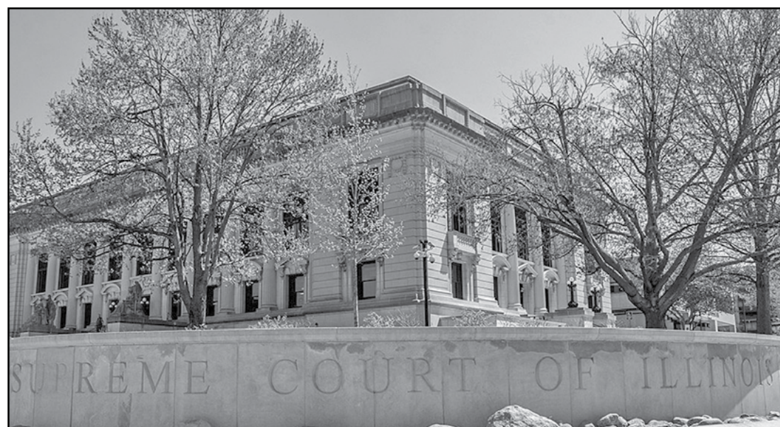
The Illinois Supreme Court is pictured in Springfield.

After passage of the bill, GBX reapplied for the permit, which the ICC approved in March 2023. Illinois Farm Bureau then