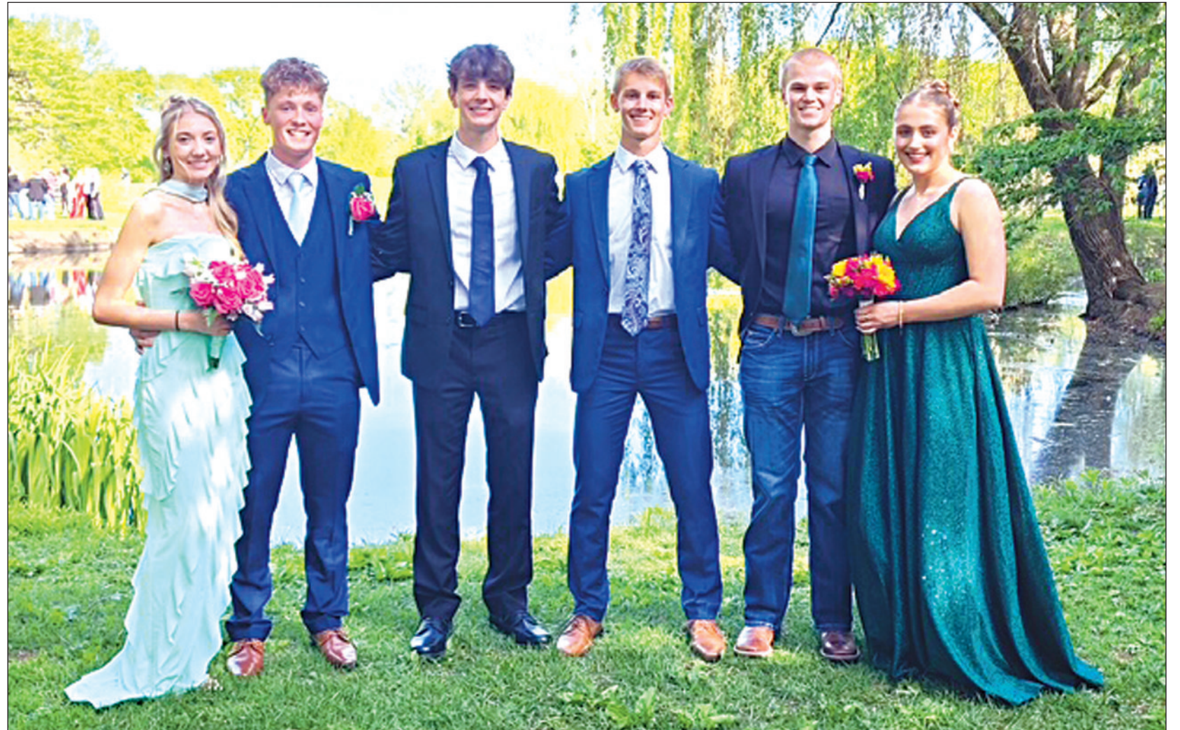
UNITY SENIORS AND JUNIORS pose at the Japan House before heading to iHotel Conference Center for Prom on Saturday April 24th, then even Juniors and Seniors who did not attend Prom could go on the trip to Six Flags in St Louis the next day.