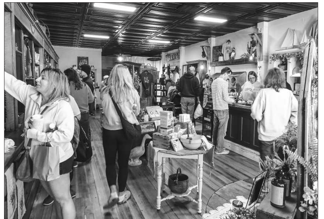
A LARGE CROWD SHOPS at The Goose & The Gander LLC during the Saturday, May 9 Inaugural Sidney Spring Fling event brought to you by The Goose & The Gander, LLC and the Sidney Improvement Group.

Your correspondent hopes readers were able to enjoy this inaugural event in downtown Sidney.