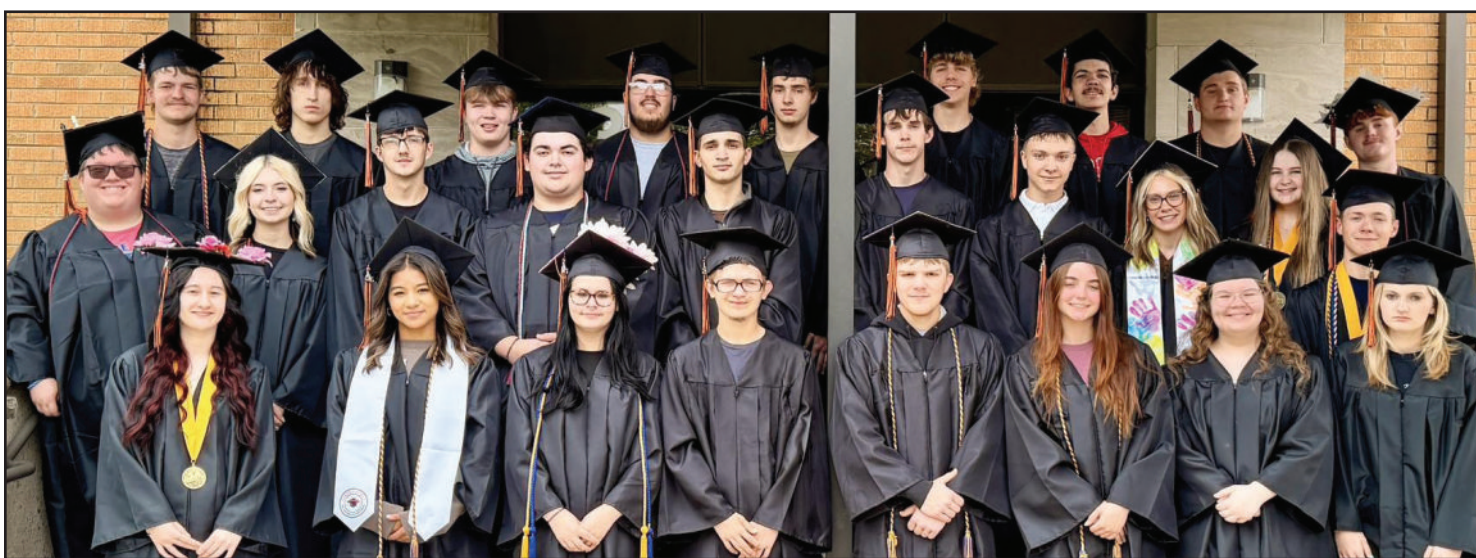
Ramsey Class of 2026