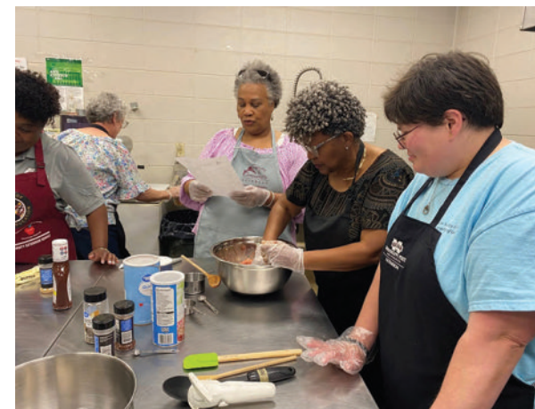
Dining with Diabetes Series off to a great start.-(Several participants shown in the kitchen during Dining with Diabetes program. This group is making the BBQ Meatloaf recipe.)