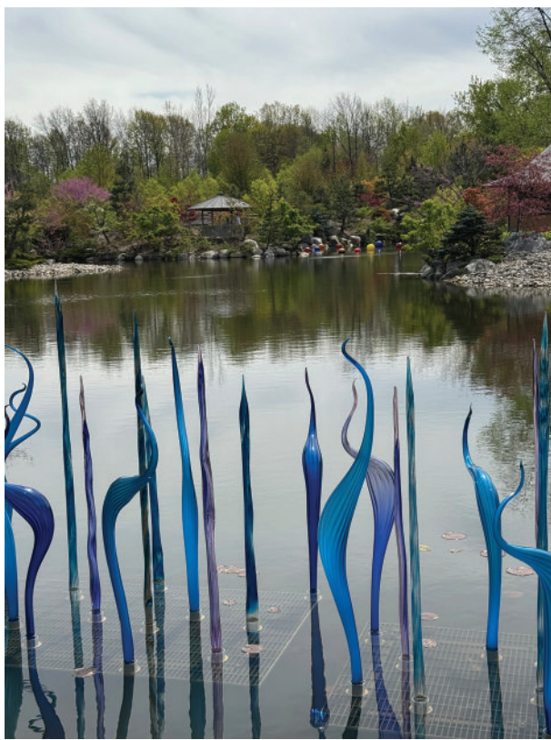
One of the glass installations in a lake in Meijer Gardens is entitled "Blue Reeds" and was created by Dale Chihuly, considered the most sought-after artist in the world working primarily in glass.