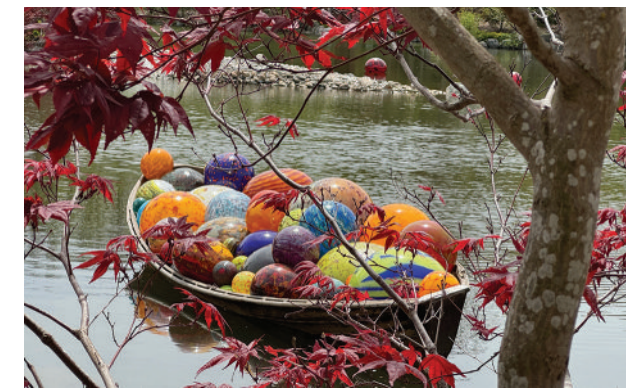
The Float Boat installation by Dale Chihuly features colorful glass spheres in a boat and is inspired by Japanese fishing floats.

balance of life. She has reminded us to not to "get so far ahead" that we won't forget to treasure the time we are in, to count our blessings, and to always be ready for a little adventure, especially if it means a road trip! I took a big road trip last week to see the tulips blooming in Michigan. They were really beautiful. The first stop was to a tulip farm where 15 acres of different varieties of tulips were planted. They were planted so there are continuous blooms for several weeks. There were so many variations of color and shapes. Then we enjoyed Windmill Island where Holland, Michigan had been given permission to relocate an actual windmill from the country of Holland. The Netherlands lost so many windmills during World War II that the Dutch government prohibited the removal of windmills. The last exception was the DeZwaan windmill now located in Holland, Michigan. It was dismantled and shipped to Michigan in 1964. The Dutch settlers